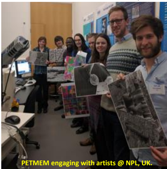
PETMEM engaging with artists @ NPL, UK.

BNC and Electrosiences are collaborating with Poet-in-the-city and Aurora Orchestra to deliver a PETMEM Public Engagement event in London on the 15th of October 2017 and later in January 2018. The key objectives are to